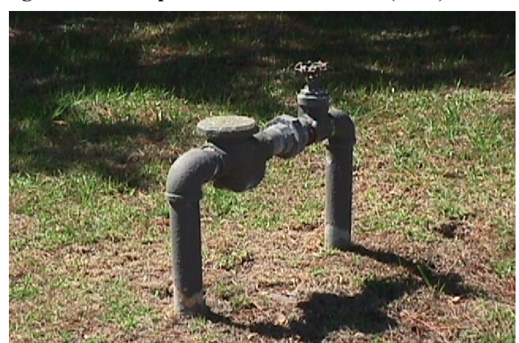
Figure 4. Atmospheric Vacuum Breaker (AVB).